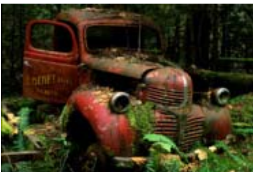
Larry Easton "Dodge Red"