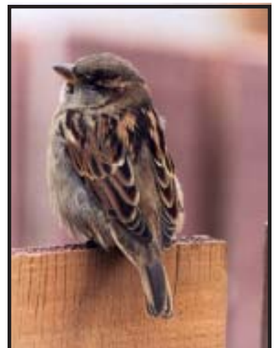
Amateur - Fauna "House Sparrow" Terry Conroy